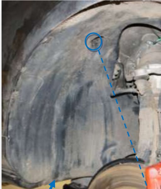
Hidden T30 torx