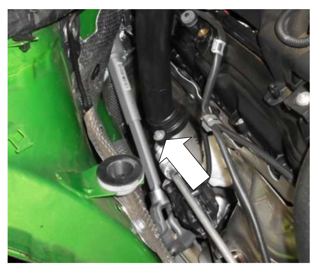
Engineered for performance