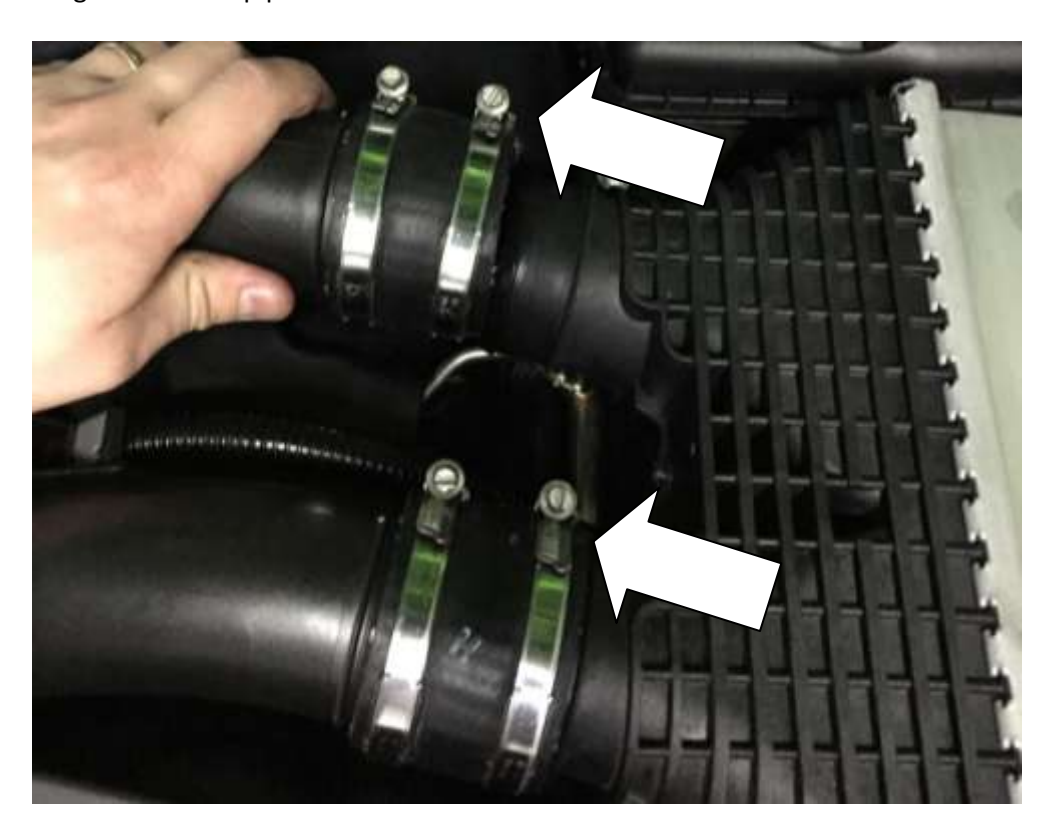
Engineered for performance

7. Using a 6mm hose clamp driver undo the 2x hose clamps and pull the OEM hoses off of the chargecooler inlet pipes.